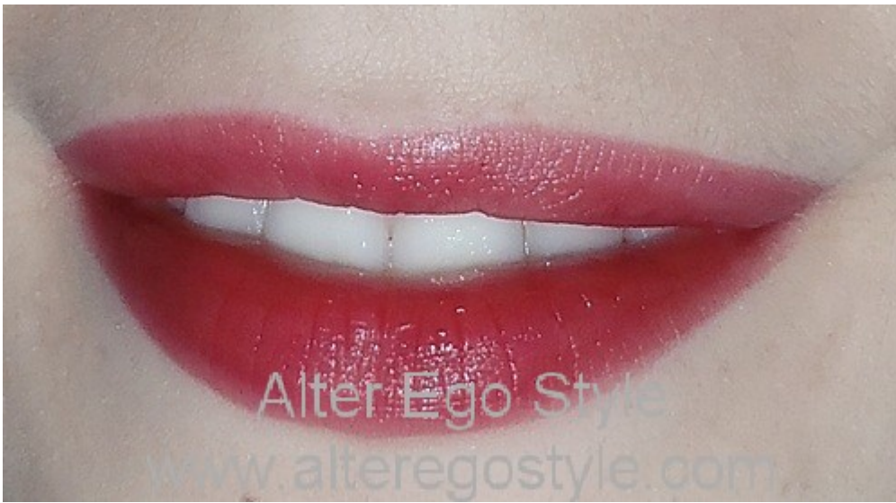
No. 050 Red & The City